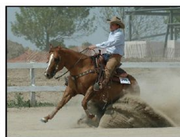
Dun It You Won It

For 2020 new prodigy's from Ynotfarms are expected. Y Not's