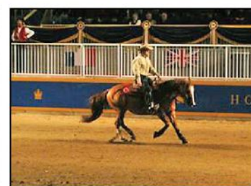
Dun It You Won It